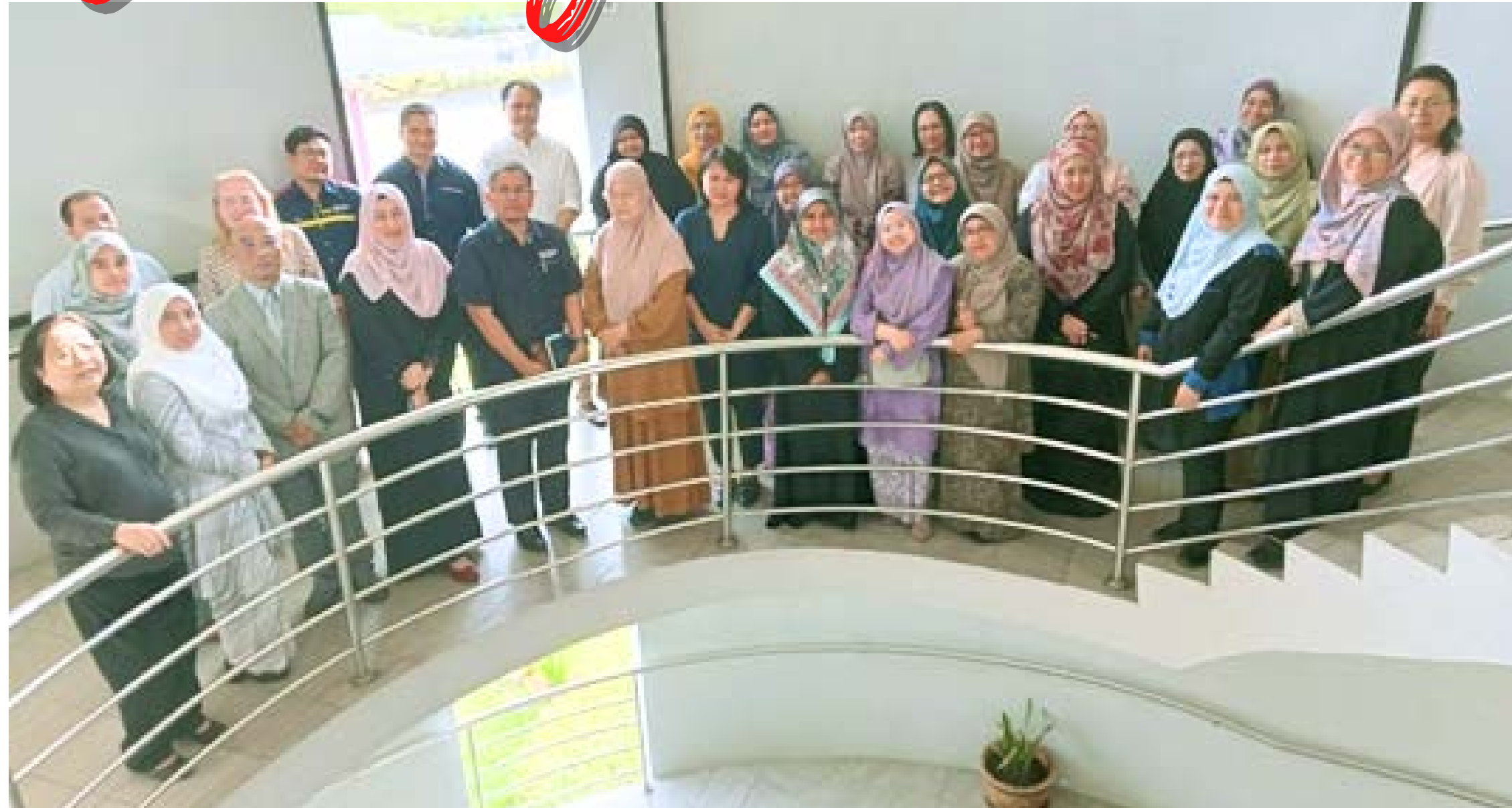
Barisan pensyarah Pusat Pengajian Sains Maklumat dan Fakulti Perakaunan bersama Timbalan Rektor (Akademik & Antarabangsa) UiTM Sarawak