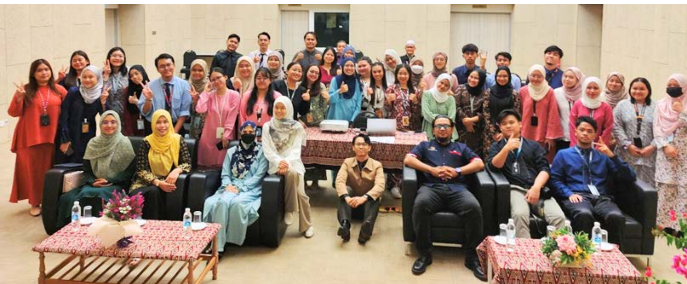
After briefing session, in the Dewan Puspawangsa.

A Journey into Knowledge to National Archive of Malaysia Sarawak Branch