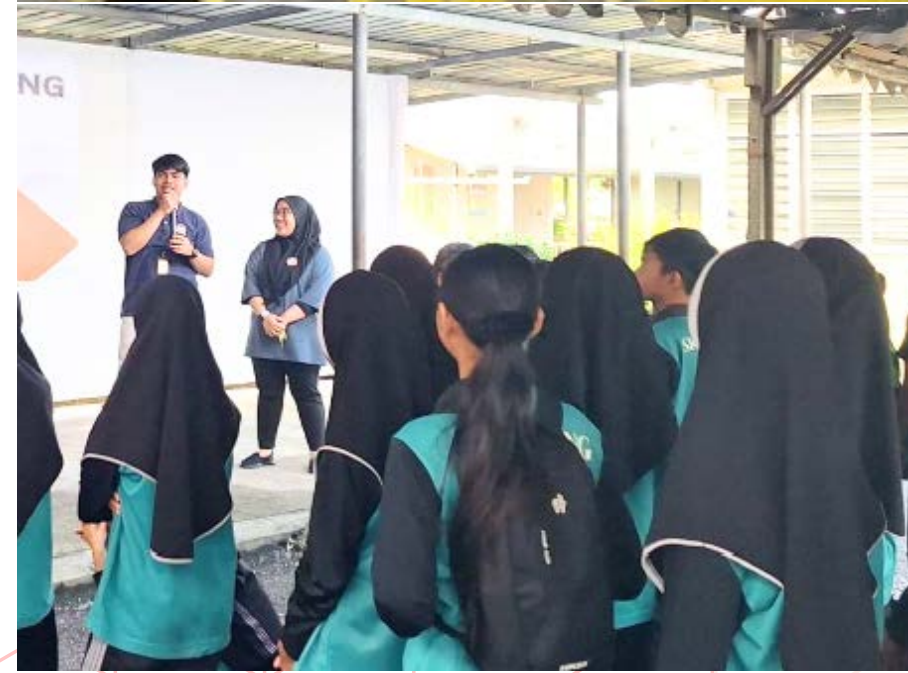
Students from SK Sageng participated in activities throughout the Techtome Explorer program