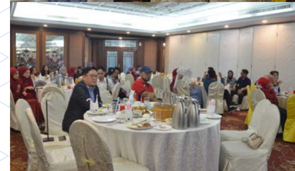
Pictures during the program: The colorful gratitude images from the INFORMS Hi-Tea celebration in blue and red