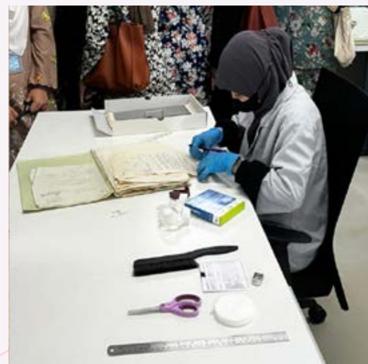
Skilled staff member showed the detailed process of preparing documents for permanent transfer to the repository

repository. She emphasized the repository's pivotal role in maintaining, preserving, and safeguarding public records in Sarawak aged over twenty-five years, as well as other documents, papers, instruments, statutes, statutory orders, regulations, or decrees, as directed by the State Secretary. These materials were deemed crucial for their historical value or public importance.