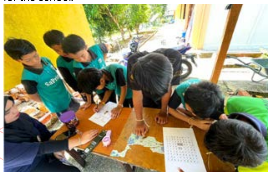
One of the activities conducted during the Tectome Explorer program