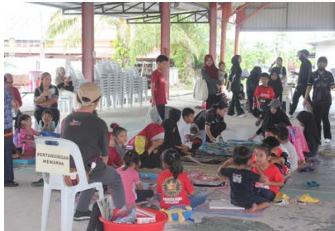
Pertandingan mewarna yang mendapat sambutan hangat dikalangan kanak-kanak Kg. Gedung

dan kesemua aktiviti selesai dalam jam 6 petang. Seterusnya, para pelajar pulang ke homestay bagi mempersiapkan diri untuk aktiviti malam kebudayaan.