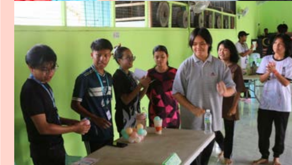
Students participate in an array of exhilarating activities, including Puzzle, Charades, Riddles, Broken Radio, and PointPong

drawn many talented young participants from Kampung Bunan. Not only that, but the adults demonstrated their artistic abilities by making Christmas trees out of used materials.