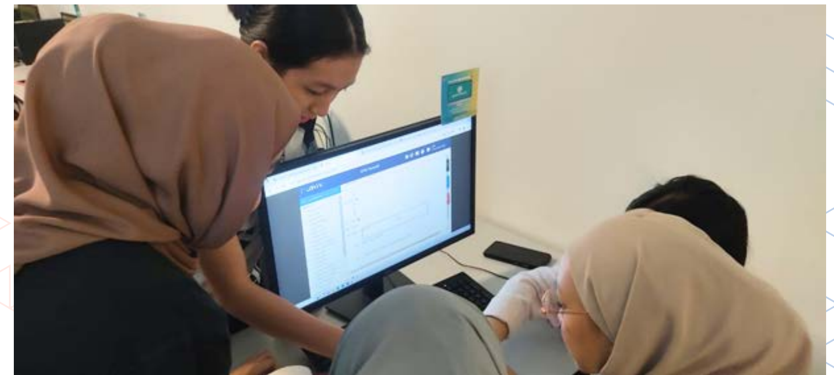
Para pelajar dibahagikan dalam kumpulan untuk memudahkan aktiviti 'hands-on'

Bengkel ini mendapat kerjasama yang jitu dari semua pihak, terutama dari pihak HEA, Perpustakaan, para pensyarah dan para pelajar. Terima kasih diucapkan. Diharapkan ilmu yang disampaikan dapat sedikit sebanyak mendorong para pelajar khususnya dalam meminati dan mempelajari subjek pengkatalogan ini dengan lebih mendalam. Di samping, mengetahui betapa ilmu pengkatalogan ini sangatlah penting bagi setiap perpustakaan.