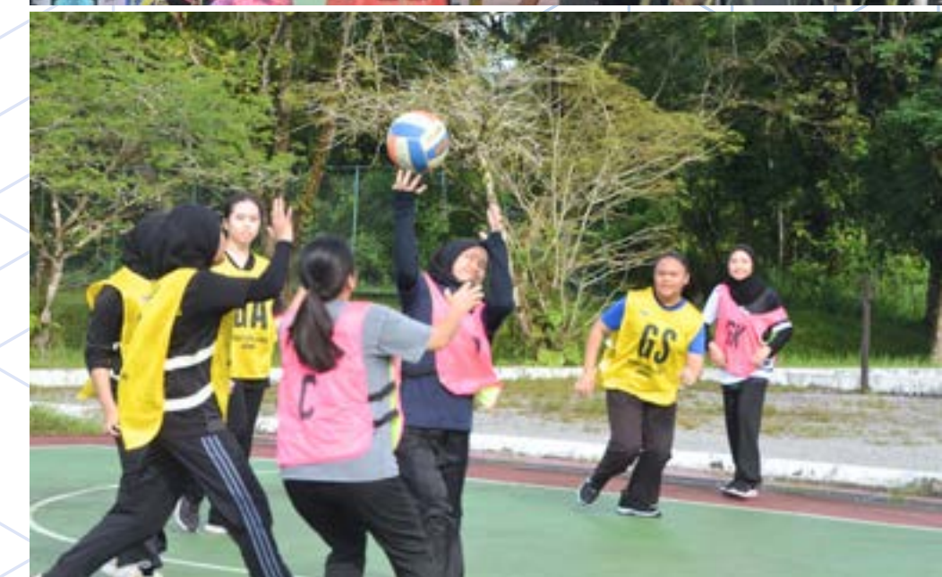
Among the pictures taken during Spirit of the Game: The excitement of getting together on INFORMS Sports Day.