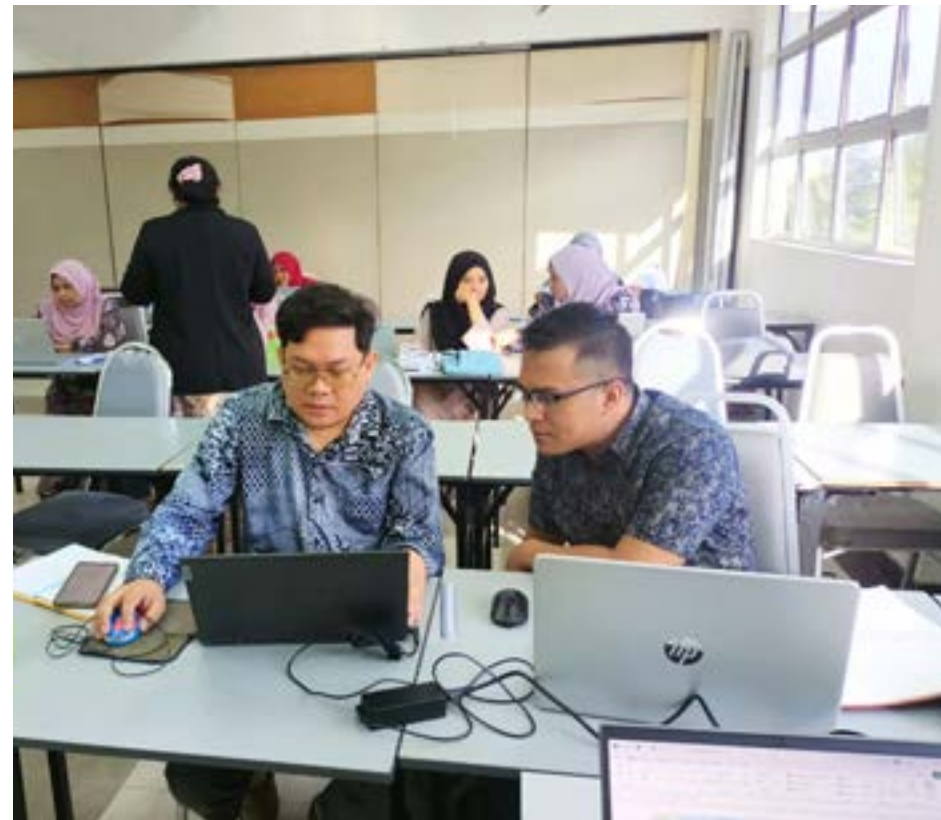
Sesi hands on semasa bengkel pengiraan PLO Attainment dijalankan

Sesi Perkongsian Bersama JK NOBLE UiTM Sarawak