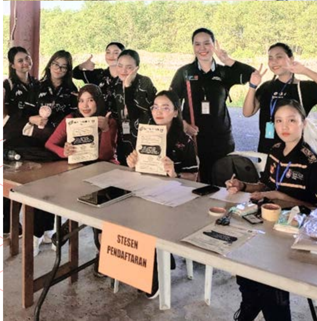
Pelajar-pelajar UiTM yang bertugas di Kaunter Pendaftaran