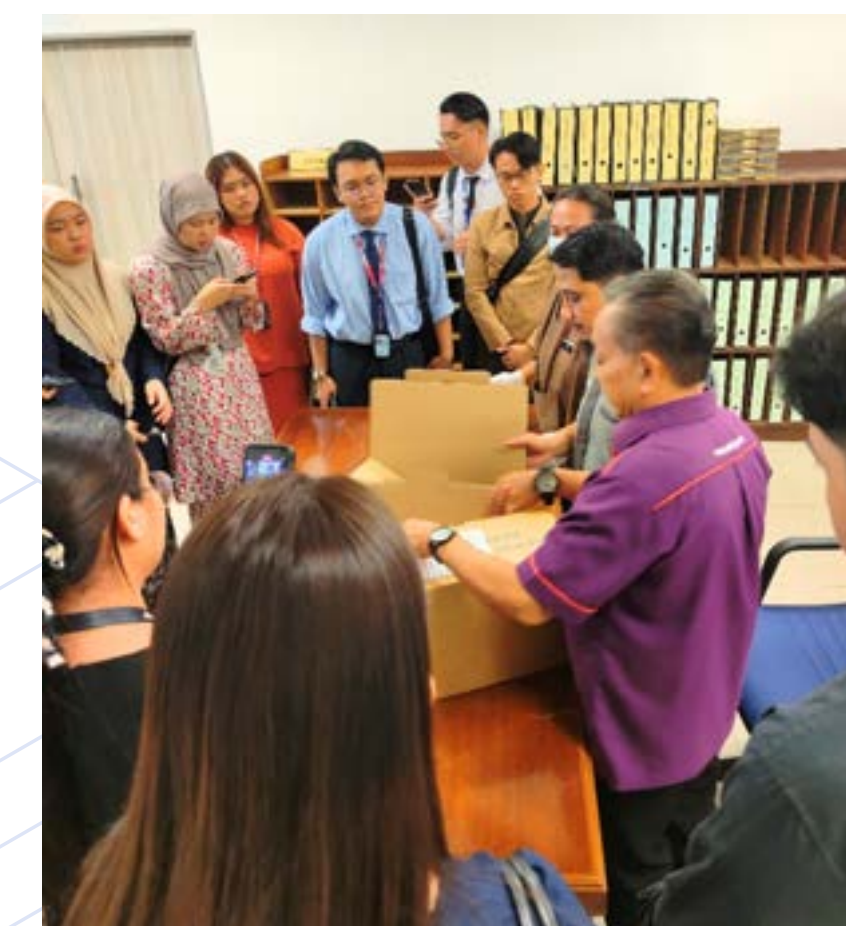
The staff explained the cleaning process before transferring archive materials into the repository.