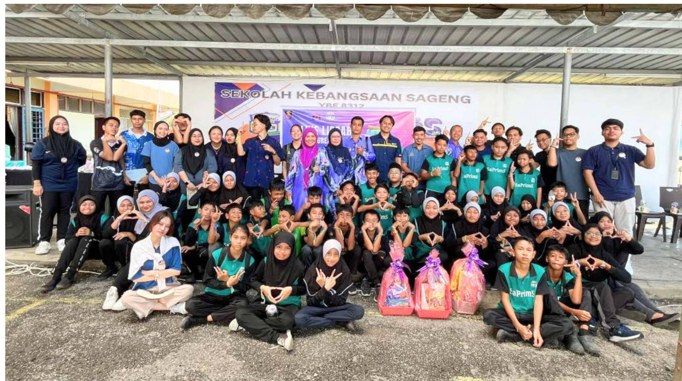
The fifth semester students from School of Information Science together with participants from SK Sageng Simunjan

Next was Storytelling, where students took the front stage. The room had an air of imagination as they brought characters from their writings to life. It was essential to understand how information functions in the real world in addition to fiction. You could sense the energy as they threw themselves into their roles, which encouraged creativity and curiosity. In perspective, these activities seem like more than just games—they were the secret flavor contributing to Live Library Adventure's outstanding reputation. The joy in the kids' eyes told it all – learning can be an adventure, and that day, it was.